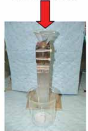
Magnetic Particle Separation