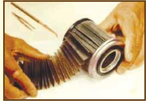
The Pall filter can be disassembled so that debris can be analyzed in situ.